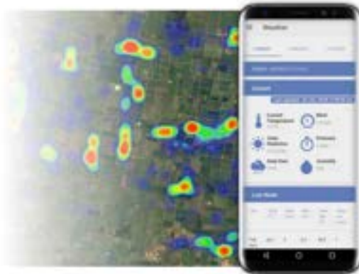
Water Ordering Mobile App