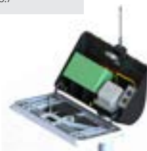
FerIT Solar Node